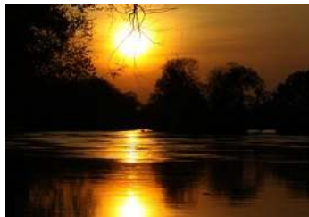
The James River in Richmond

CRLC seeks to safeguard natural areas through the donation of conservation easements or other legal tools which extinguish development rights. It carries out its mission by educating landowners and communities in the Capital Region about land protection resources. Although there are other Richmond area organizations which serve a variety of conservation needs, CRLC fulfills a unique role in the region because it is the only regionally focused land conservancy. CRLC exists to increase the amount of conserved land in the capital region, and it alone devotes its resources to increasing area landowners' knowledge of conservation easements and other land protection tools, and by assisting landowners during the often lengthy and confusing easement donation process.