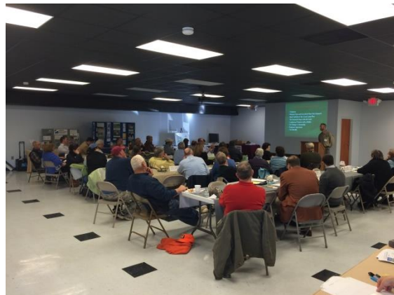
Lunch and Learn (Powhatan County)