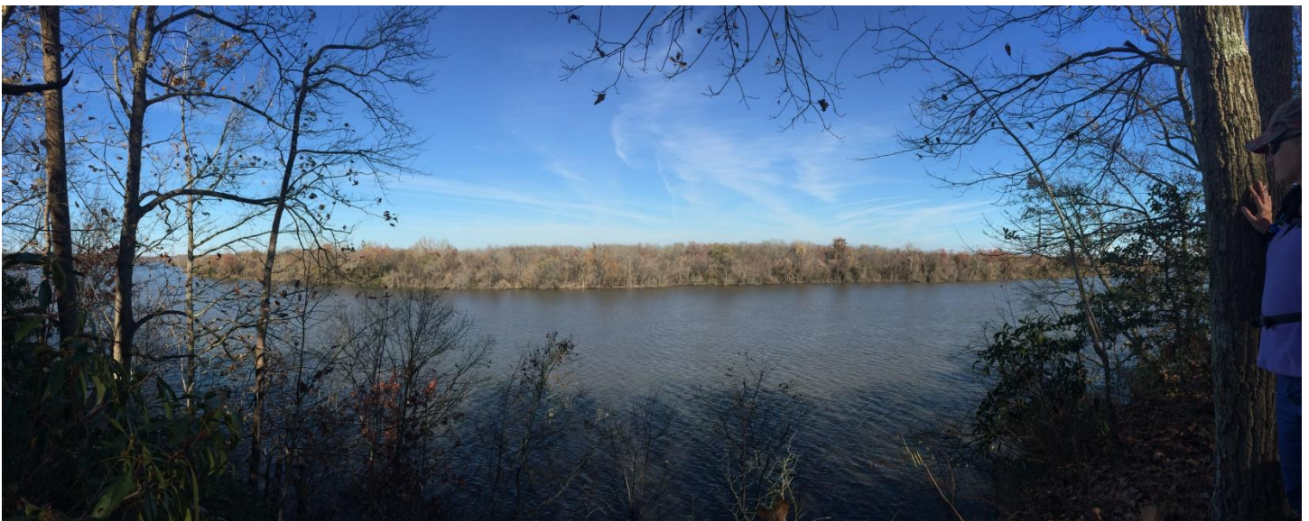
Brown & Williamson Conservation Area (Chesterfield County)

Since its inception in 2005, the Capital Region Land Conservancy has facilitated the protection of over 6,750 acres and 34 miles of stream frontage in the Richmond region. 2015 will mark our Tenth Anniversary!