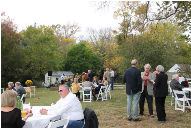
10 th Anniversary Celebration (Goochland County)