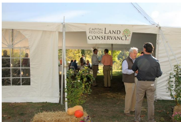
Fields Forests + Streams (Goochland County)