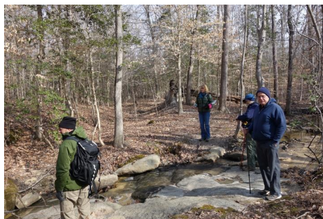
Guided Hike at Atkins Acres (Chesterfield County)