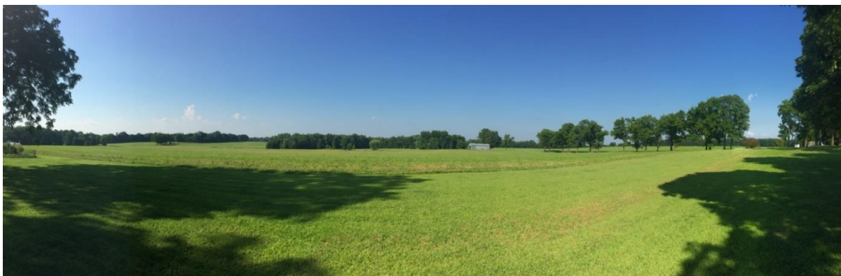
Malvern Hill Farm (Henrico County)

Conservation easements are voluntary legal agreements that place permanent limits on future development in order to protect the land's conservation values. Each easement is unique and negotiated between the landowner and the public agency or conservation organization that holds the easement. Except for rights explicitly given up in the easement document, the landowner continues to own, use, and manage the land. The land can be farmed, hunted, sold and passed to heirs.