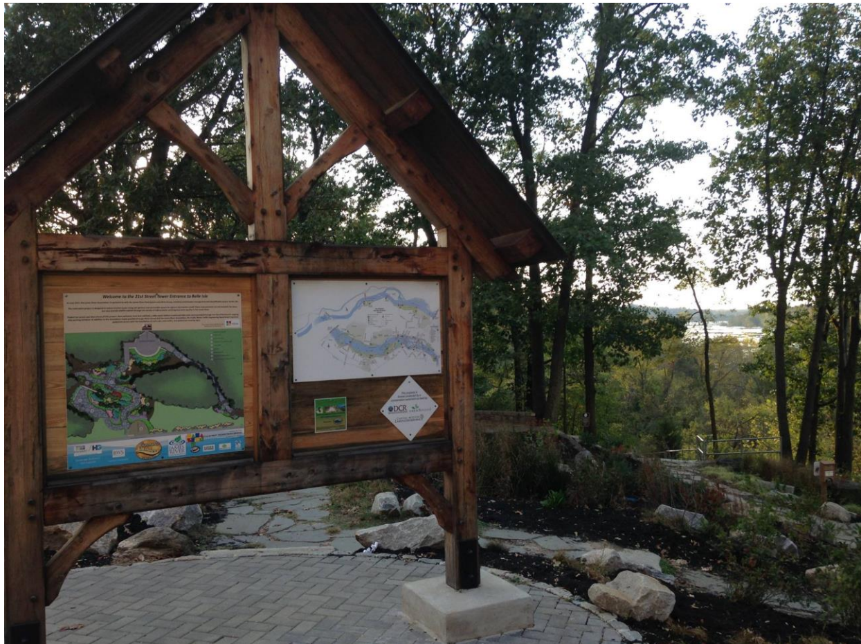
New Conservation Easement Sign in James River Park (Richmond)