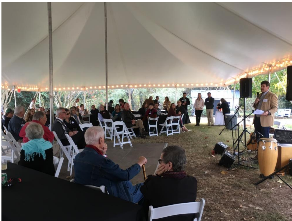
Fields Forests + Streams (Goochland County)