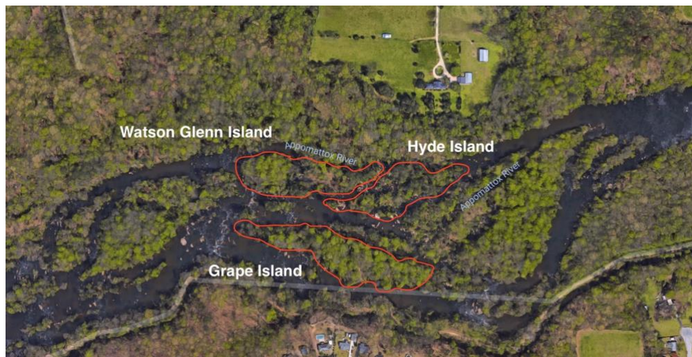
Three Islands in the Appomattox River gifted to CRLC from Joan Cowan (Chesterfield County)