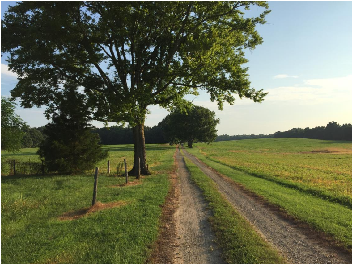
Malvern Hill Farm (Henrico County)

* beginning net assets were $454,060 at 01/01/2018 and year-end net assets on 12/31/2018 were $2,958,605.