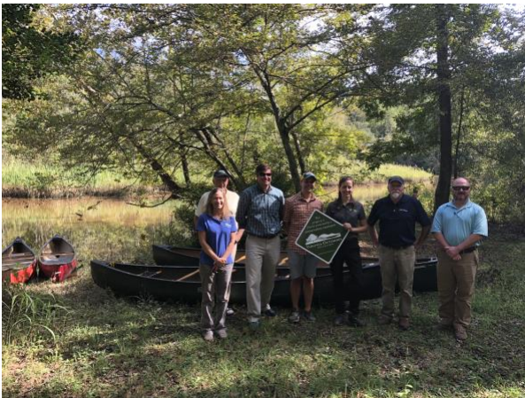
Turkey Island Creek (Henrico County)