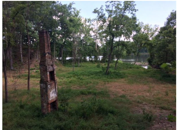
Deep Bottom II (Henrico County)