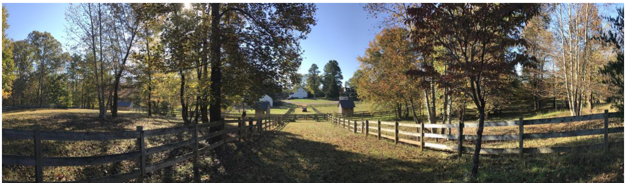
Westerham (Hanover County)

Conservation easements are voluntary legal agreements that place permanent limits on future development in order to protect the land's conservation values. Each easement is unique and negotiated between the landowner and the public agency or conservation organization that holds the easement. Except for rights explicitly given up in the easement document, the landowner continues to own, use, and manage the land. The land can be farmed, hunted, sold and passed to heirs.