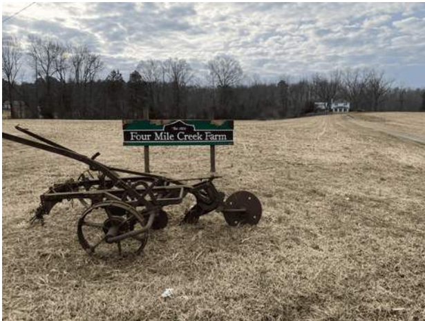
Four Mile Creek Farm

CRLC maintained full accreditation by the Land Trust Accreditation Commission, an independent program of the Land Trust Alliance. CRLC also maintained accreditation by the Better Business Bureau and earned the Guidestar Platinum Seal of Transparency for 2022.