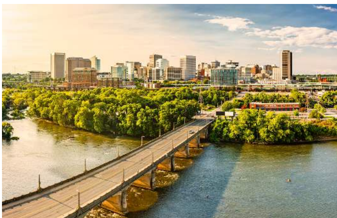
Mayo's Island in the City of Richmond

In 2022, CRLC negotiated and facilitated a purchase agreement for 14.5 acres at Mayo's Island in the City of Richmond for $11.4 million. The conservancy was awarded but has not yet fulfilled obligations for grant funding in the amount of $1.5 million from the Virginia Land Conservation Foundation and $7.5 million from the Virginia Community Flood Preparedness fund towards the acquisition and protection of this property as a future public park. CRLC is helping to raise the remaining funding for Mayo Island and ensuring its transfer to the City of Richmond.