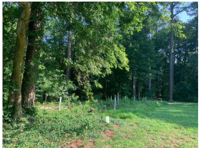
Reforestation at Bandy Field Nature Park

CRLC held 12 conservation easements and co-held 16 conservation easements as of 12/31/2022. The easements held by CRLC at the end of 2022 protect an additional 547 acres. CRLC co-held easements protect 2,115 acres. Altogether, CRLC is responsible for stewarding 28 conservation easements protecting 2,662 acres. Furthermore, CRLC has facilitated easements on another 9,923 acres.