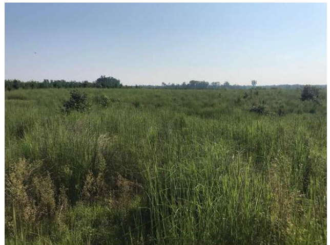
Field at the Varina LandLab