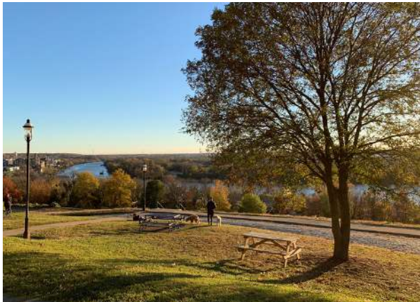
The “View that named Richmond” from Libby Hill overlooking Dock Street Park.

CRLC is the only land trust devoted specifically to conservation within the Counties of Charles City, Chesterfield, Goochland, Hanover, Henrico, New Kent, and Powhatan as well as the Town of Ashland and City of Richmond. We are proud to have conserved more than 13,000 acres of land in this special region.