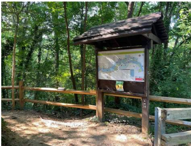
James River Park System trailhead at Rogers Woods

CRLC maintained full accreditation by the Land Trust Accreditation Commission, an independent program of the Land Trust Alliance. CRLC also maintained accreditation by the Better Business Bureau and earned the Guidestar Platinum Seal of Transparency for 2022.